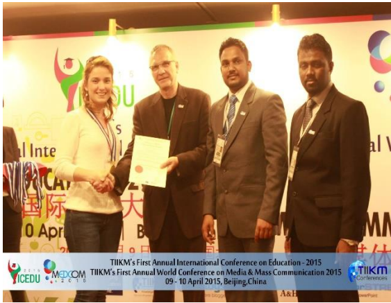
TIKM's First Annual International Conference on Education - 2015 TIKM's First Annual World Conference on Media & Mass Communication 2015 09 - 10 April 2015, Beijing, China