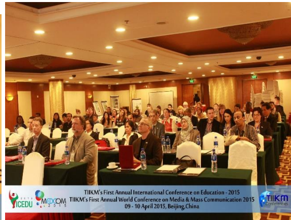
TIKM's First Annual International Conference on Education - 2015 TIKM's First Annual World Conference on Media & Mass Communication 2015 09 - 10 April 2015, Beijing, China