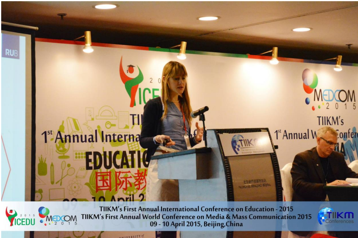
TIKM's First Annual International Conference on Education - 2015 TIKM's First Annual World Conference on Media & Mass Communication 2015 09 - 10 April 2015, Beijing, China