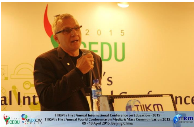
TIKM's First Annual International Conference on Education - 2015 TIKM's First Annual World Conference on Media & Mass Communication 2015 09 - 10 April 2015, Beijing, China